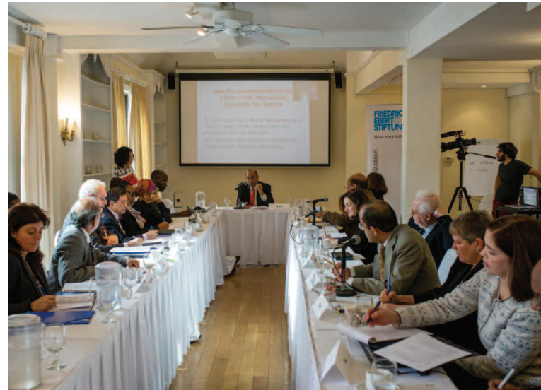
> ICRICT Commission Meeting March 18, 2015

Related party transactions represent a significant and growing share of global trade. In these transactions, the price assigned to value the exchange in a transaction is often referred to as a ‘transfer price.’ In order to ensure accuracy, the ‘arm’s length principle’ prescribes that transfer prices should be the same as the prices that the companies would have used if they had been unrelated parties negotiating under market conditions, and not part of the same corporate group. The OECD and the United Nations have endorsed the arm’s length principle in their Model Tax Conventions, which are widely used as the basis for bilateral treaties between governments.